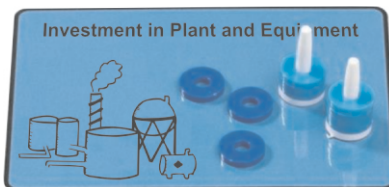
A pic of a small part of one of our games

The Business Experience is experiential and suitable for all key learning styles: it has significant tactile, auditory and visual components ensuring that all delegates become actively engaged in the program right from the start